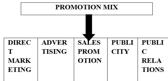
Fig 2: Promotion Mix Tools

Sales promotion also helps in understanding the buying behavior of consumers since it helps in identifying which customers prefer shopping during the offer session and which customers prefer on time delivery and other services while buying a product online. Thus, it helps in customizing the offers and services offered to different customers based on their buying patterns.